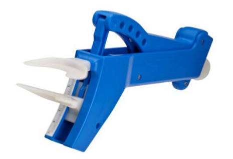
Figure 1 TheraBite® Jaw Mobilizer

The TheraBite Jaw Mobilizer (Figure 1) utilizes repetitive passive motion and stretching to restore mobility and flexibility of the jaw musculature, associated joints, and connective tissues. The TheraBite is the only device available which provides patients with anatomically correct jaw motion. It also helps reduce patients' anxiety by allowing them to control the extent and length of each stretch. While conventional therapies offer mostly stretching to increase jaw opening, the TheraBite provides both anatomically correct stretching and passive motion for effective jaw rehabilitation therapy. The device is available in an Adult and a Pediatric version.